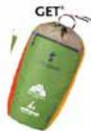
GET Cotopaxi - Eastern Mountain Sports Exclusive STP Pack