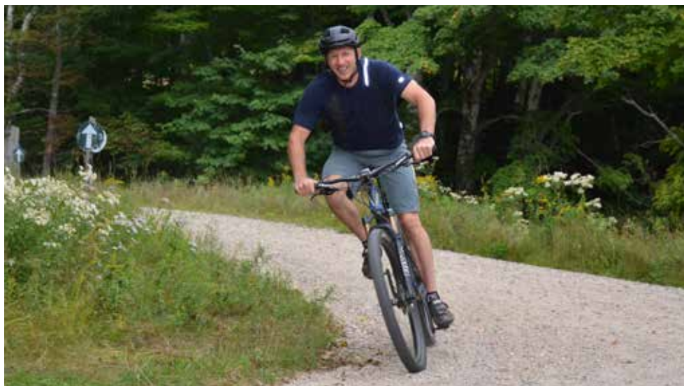
Mountain biking at Great Glen Trails Outdoor Center.