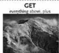
A Great Washburn Print (20"x16" framed)